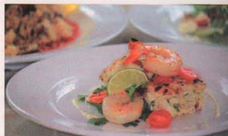
Left: Arugula with walnuts and gorgonzola cheese with an herb vinaigrette. Above (top to bottom): Calamari with peppers, garlic and tossed with balsamic reduction; Pan-seared crab cakes, topped with grilled shrimp and grape tomatoes.